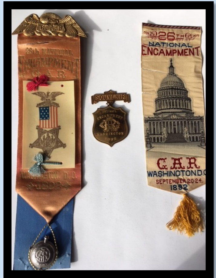
Encampment Ribbons and Badges