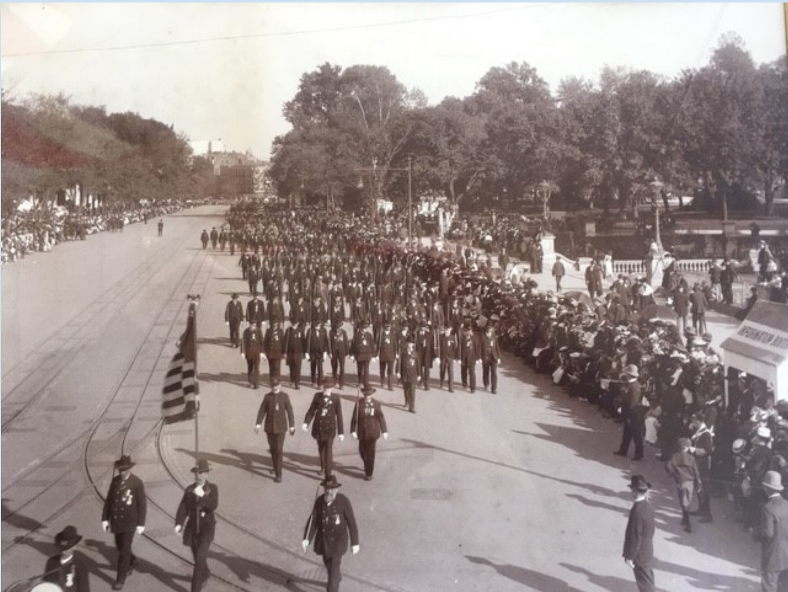
G A R parade on Pennsylvania Avenue in Washington DC, September, 1892