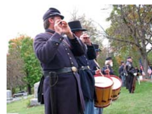
The last from Mount Hope