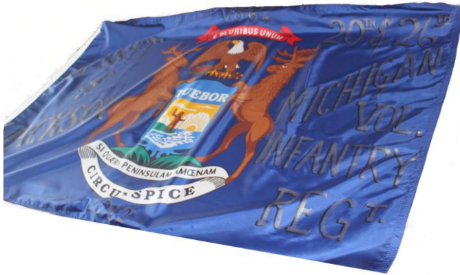
Photo: Battle flag