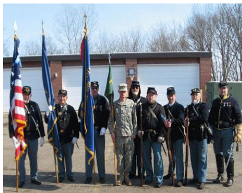
Camp 7 members with the Standard Bearer of the 303.

On Sunday February 26 th , members of Camp 7 along with members of Company B., 7th Michigan re-enactors, and 2nd Michigan Light Artillery, Battery B. had the honor of presenting the Colors for the 303 MP Activation Ceremony. The 303 is being deployed to Afghanistan.