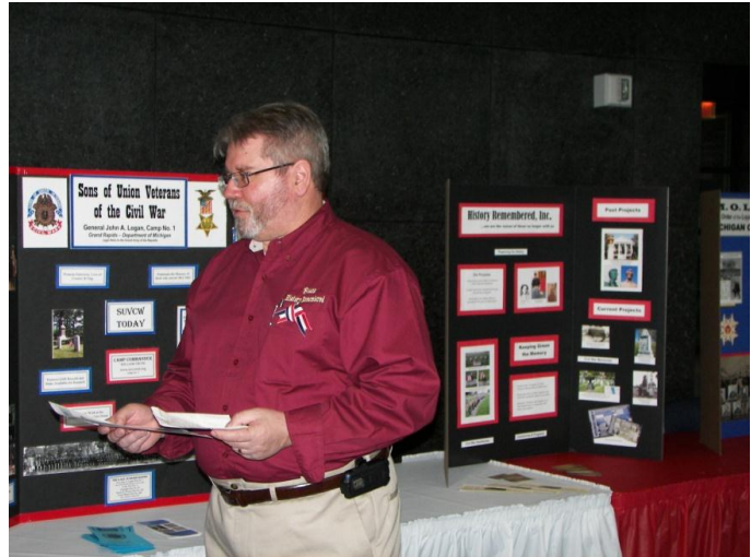
Brother Butgereit sharing information at the tables