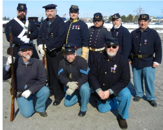
Photo: Brothers from U.S. Grant Camp 67 and Austin Blair Camp 7.

On Sunday, March 26 th , Brothers from Grant Camp and Austin Blair Camp 7 attended a deployment ceremony where they combined their efforts to serve as an Honor Guard and perform a musket firing salute for the soldiers of the 303 rd Military Police Company from Jackson as they are to be deployed to Afghanistan. A Civil War era cannon also fired a salute. The deployment of the 303 rd also coincides with the deployment in 1862 of Jackson area Companies from the 20 th and 26 th Michigan Infantry Regiments. A battle flag was presented to the 303 rd .