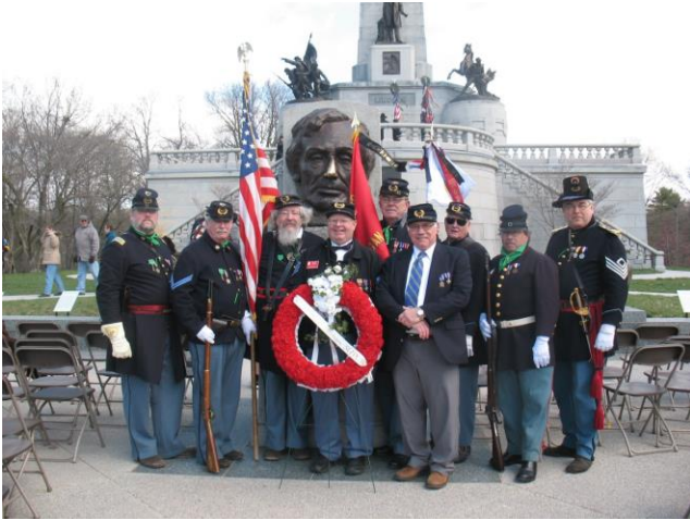
Group photo of those involved from the Dept of Michigan