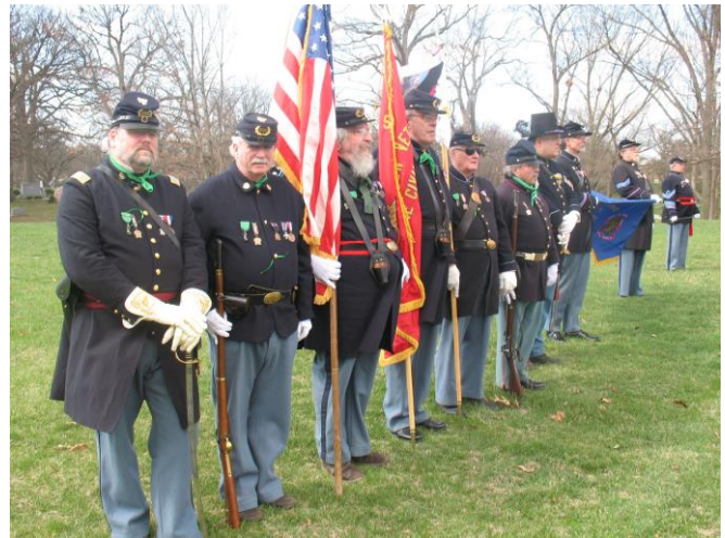
14th MI SVR