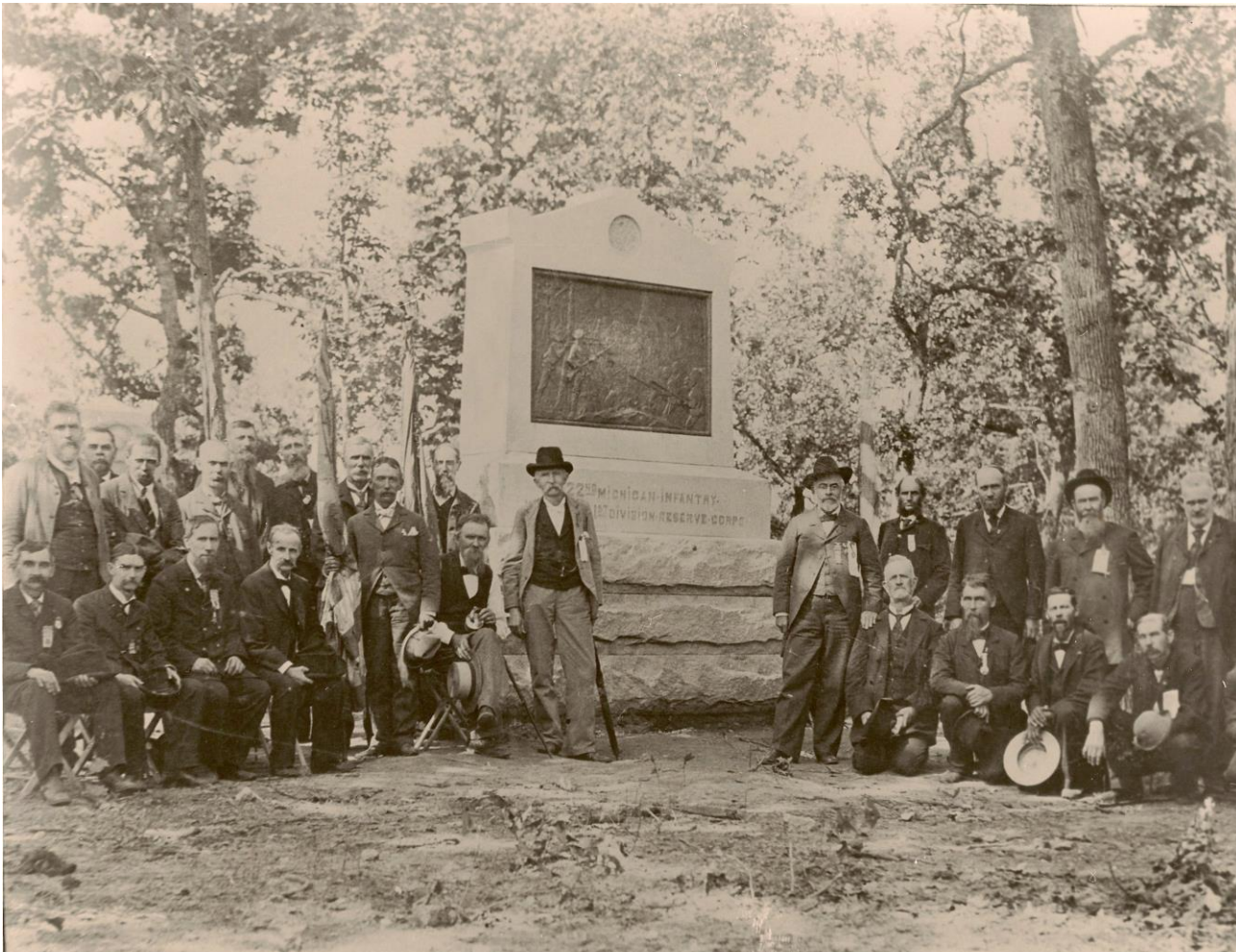
Dedication of the Michigan Monument at Chickamauga , September 18, 19 & 20, 1895

This boy attracted the attention of the noble-hearted Thomas, who sent him to school at his own expense, then obtained an appointment for him at West Point, and he is now a very gentlemanly officer of the army. (written 1882)