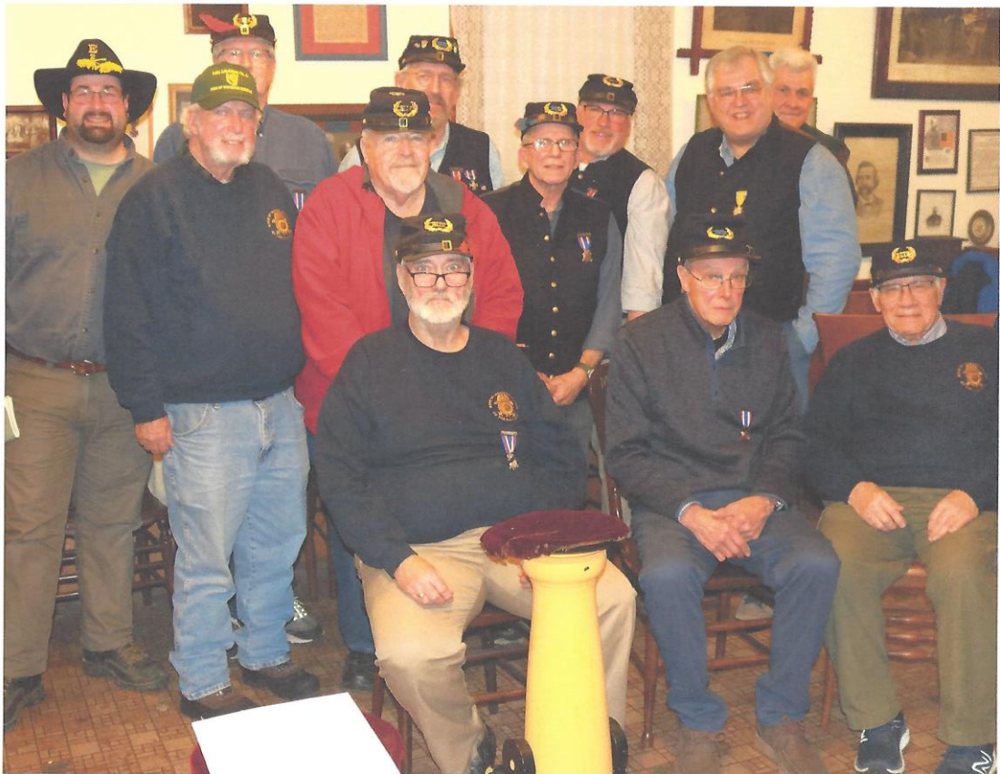
In January, Camp 17 elected officers for the 2024 Season.