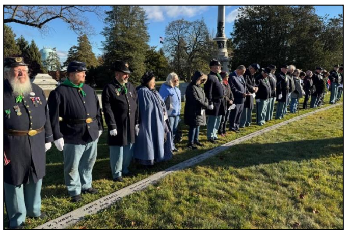
14th Michigan SVR Gettysburg Memorial Service