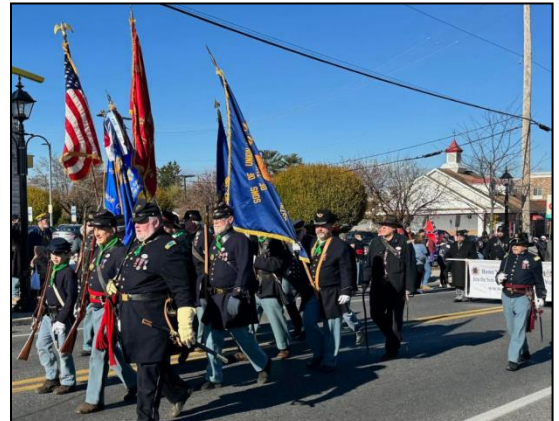
14th Michigan SVR Gettysburg Remembrance Day Parade