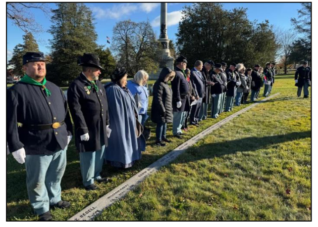
14th Michigan SVR Gettysburg Memorial Service