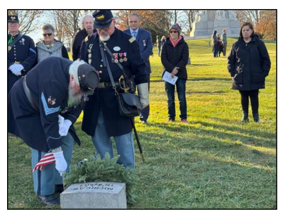
14th Michigan SVR Gettysburg Memorial Service