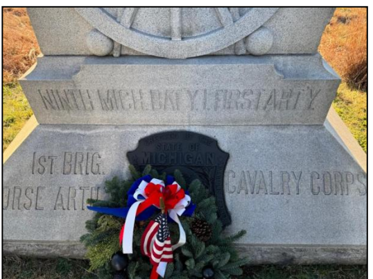
14th Michigan SVR Gettysburg 9th Michigan Artillery Memorial Service