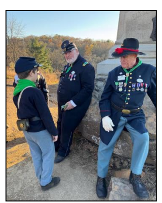
14th Michigan SVR Gettysburg 9th Michigan Artillery Memorial Service