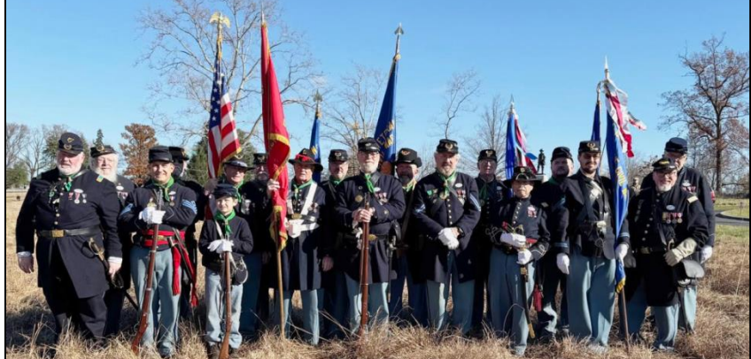
14th Michigan SVR Gettysburg Remembrance Day Participants