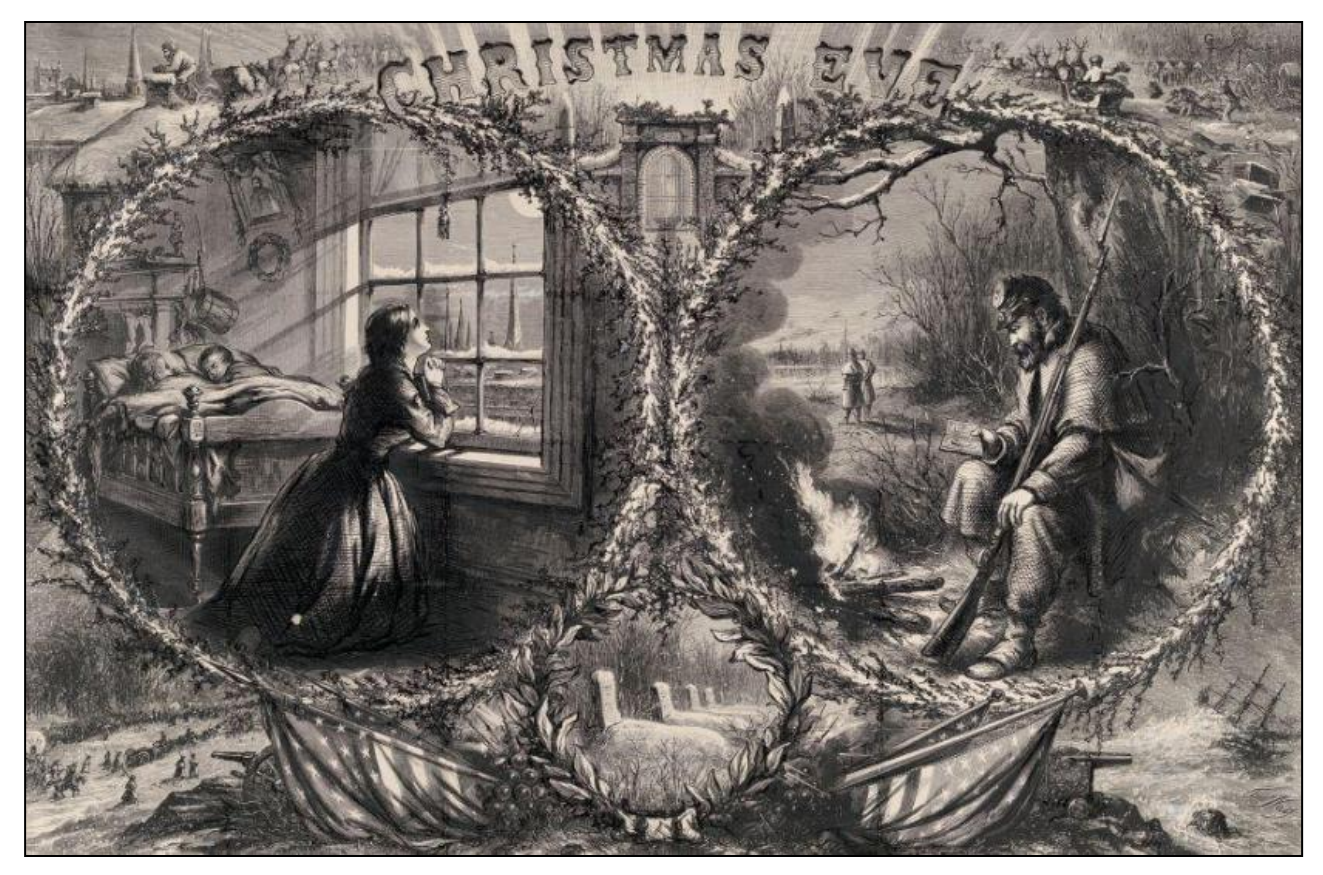
"Christmas Eve" an illustration by Thomas Nast for Harper's Weekly, 03 January 1863